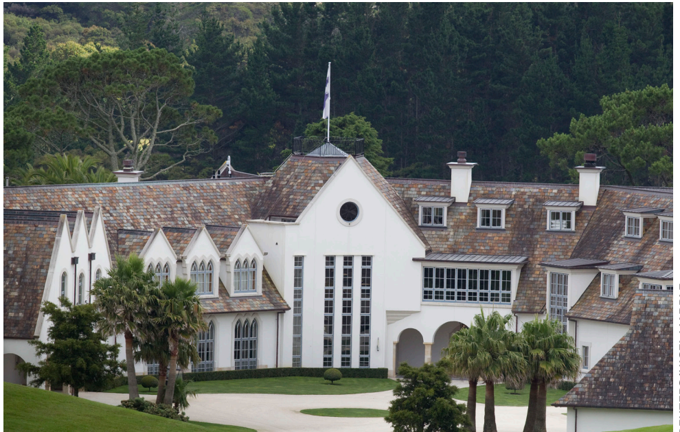
MEGAMANSION: The mansion in Auckland of Kim Dotcom, founder of Megaupload who invested in New Zealand's investor visa program.

"They're pirates of the Caribbean," he says of companies handling the citizenship business. "The situation of the country predicates that they are open to citizenship by investment. St. Kitts' debt is 180 percent of its GDP. How can the government say no?"